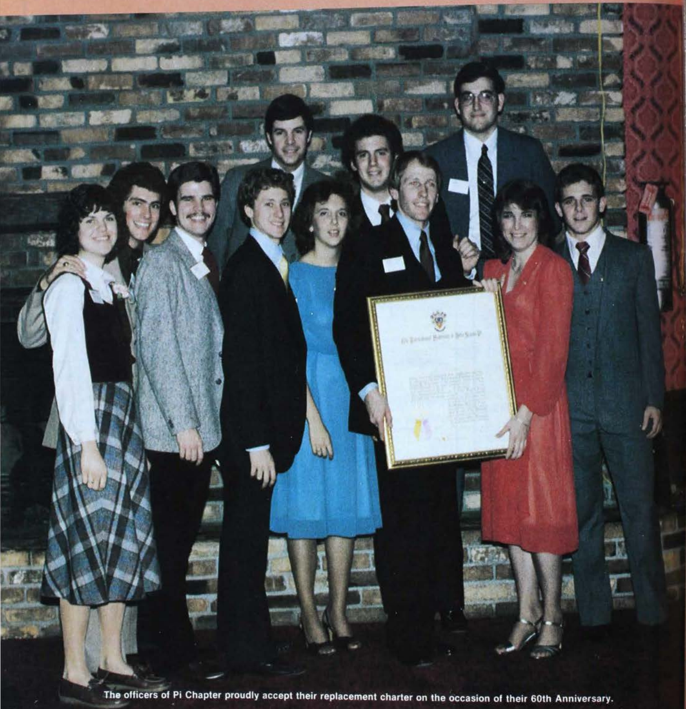
The officers of Pi Chapter proudly accept their replacement charter on the occasion of their 60th Anniversary.