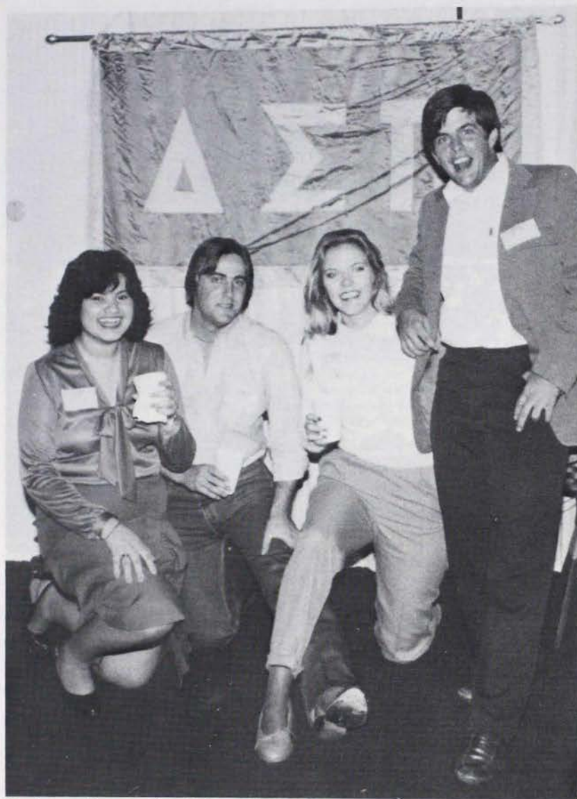
Members and prospective pledges at Iota Psi Chapter at Corpus Christi pause after a successful Meet the Chapter party.