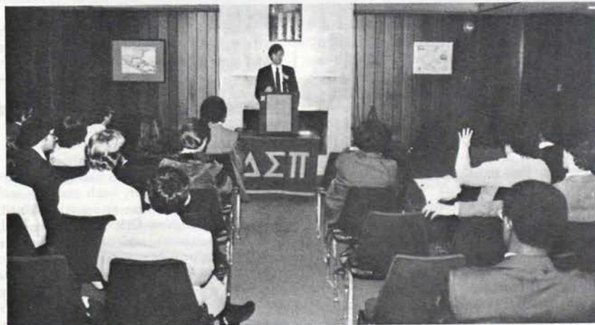
Eta Upsilon Chapter at West Florida sponsored a campus-wide forum on the Economic Recovery Act moderated by a representative of Merrill, Lynch, Pierce, Fenner and Smith.

Spring semester for Beta Zeta Chapter was a rewarding time. Our first activity was the rush reception which took on a new look this year. The program featured speeches, slide presentations, and fine food buffet style. This overwhelmingly successful rush culminated in the initiation of 36 new members.