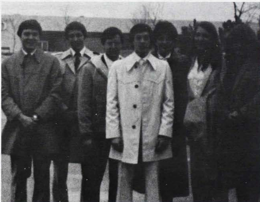
Members of Alpha Upsilon chapter at Miami University recently toured the Montgomery Ward Distribution Center in Cincinnati.

We were kept abreast of the activities of the business world through a strong program of speakers, tours and projects. In March, Alpha Upsilon Chapter visited Avon; in April, Kroger. Both are in Cincinnati, so we invited Theta Lamb-