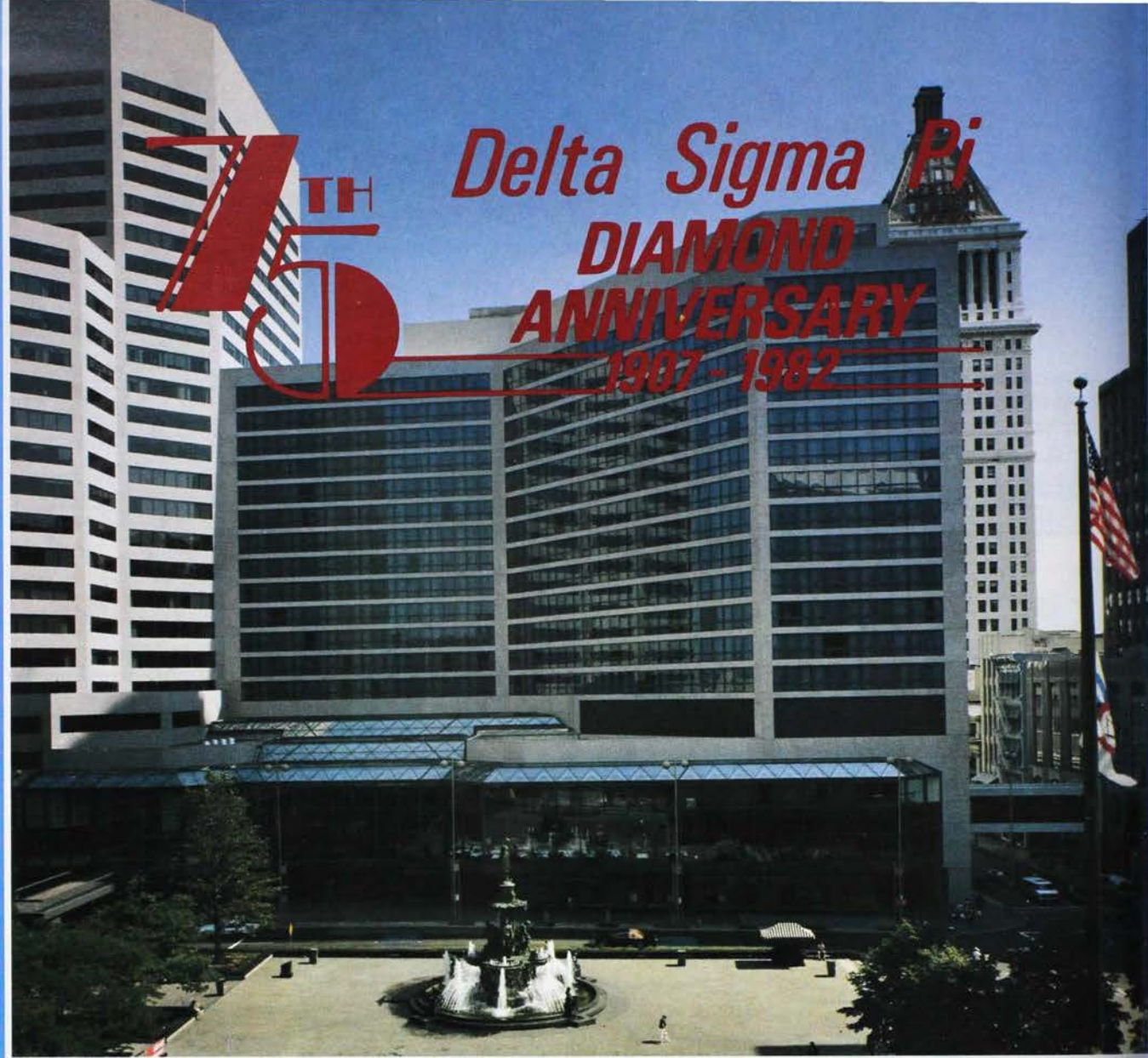
The Westin Hotel at Fountain Square

November 6, 1982, is the date for all Deltasigs to mark on the calendar for on the 75th eve of the founding of our fraternity, Deltasigs from near and far will gather in Cincinnati for the National Diamond Anniversary Celebration. Little did our Founders know that, 75 years after they established Delta Sigma Pi at New York University, an international fraternity with more than 107,000 members and more than 200 chapters in North America would result.