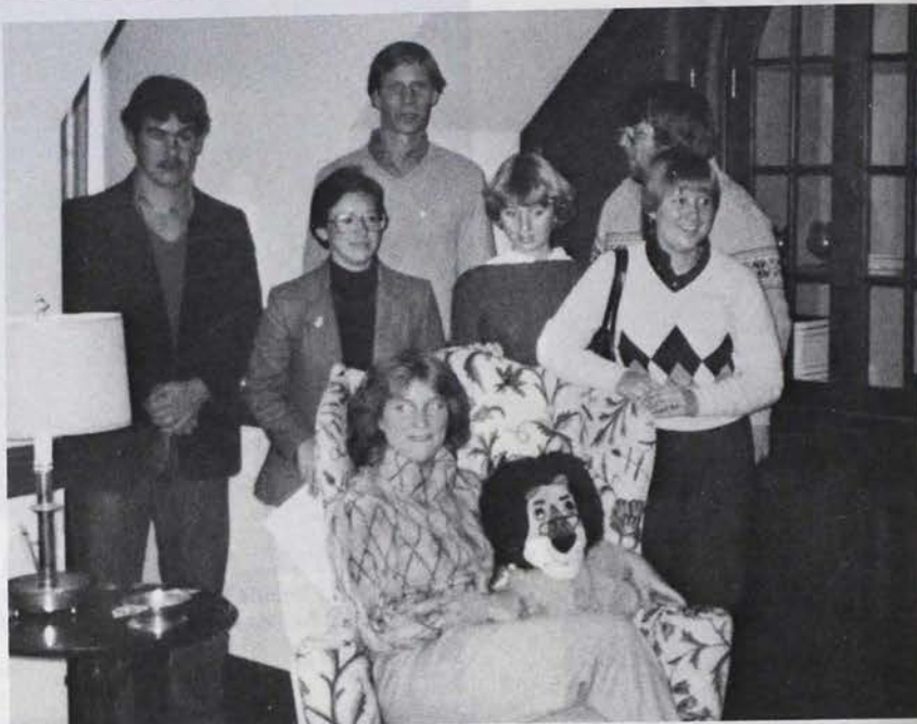
Also visiting The Central Office recently were members of Epsilon Xi Chapter at Ball State.

pered both professionally and socially and we hope to continue this success in the future.