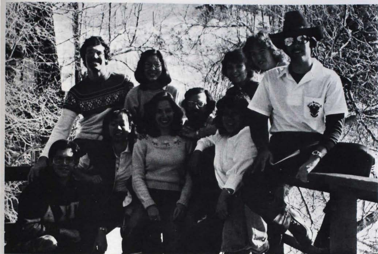
Winter ran into spring in many parts of the country this year and some of the members of Delta Sigma Chapter at Loyola-Marymount went to the Sierras for a weekend retreat.