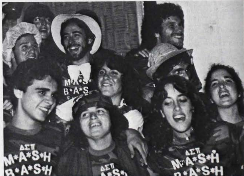
Pledges of Beta Eta Chapter at Florida sponsored a "M*A*S*H Bash" during the past semester.