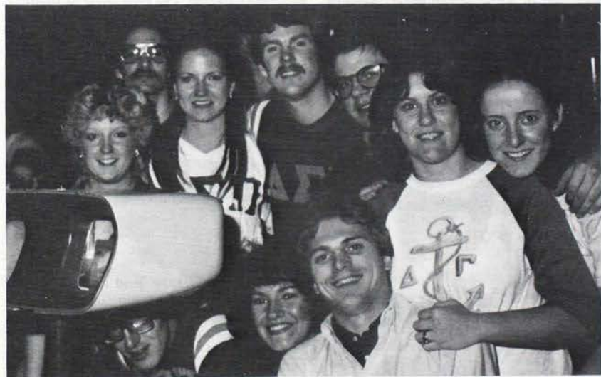
Members of Gamma Tau Chapter at Southern Mississippi participate in intramural bowling with three teams.