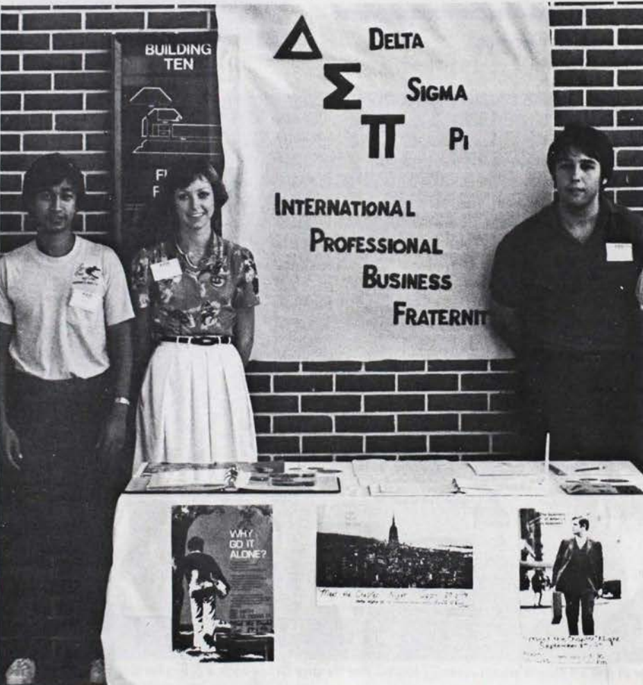
A professional recruiting table was utilized by the members of Kappa Pi Chapter at North Florida for their first semester of recruiting.