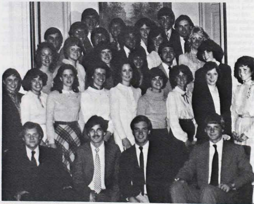
Gathered here are the spring, 1982, pledges of Beta Iota Chapter at Baylor.