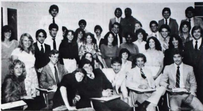
Members and pledges of Beta Eta Chapter at Florida gathered before initiation activities for this group shot.

Greetings to all Brothers from the Beta Omega Chapter. The Beta Omega Chapter is in excellent shape, going into the new year with 35 undergraduate Brothers. February 7 we installed 18 very enthusiastic pledges. The new year also saw the reactivation of the Greater Miami Area Alumni Club, a proud moment for us all. We expect to see a lot