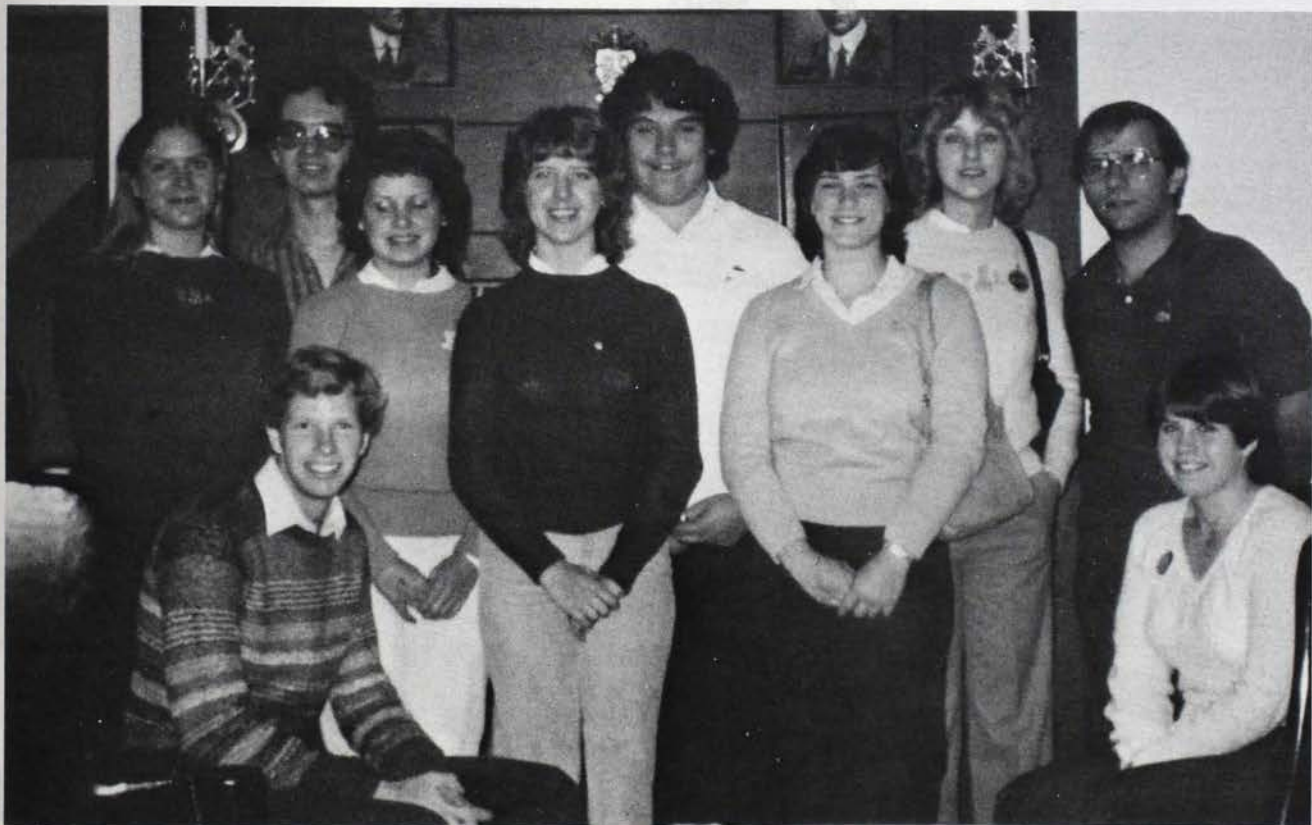
Part of the delegation from Iota Tau Chapter at Robert Morris which recently toured The Central Office took a break for this photo taken in the Founders' Room.