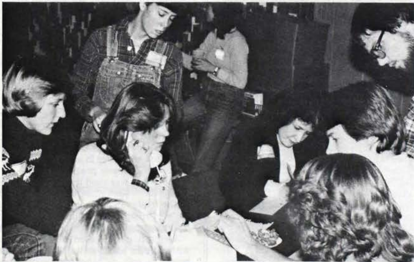
Participating in a Phone-A-Thon for a local charity are members of Alpha Gamma Chapter at Penn State.