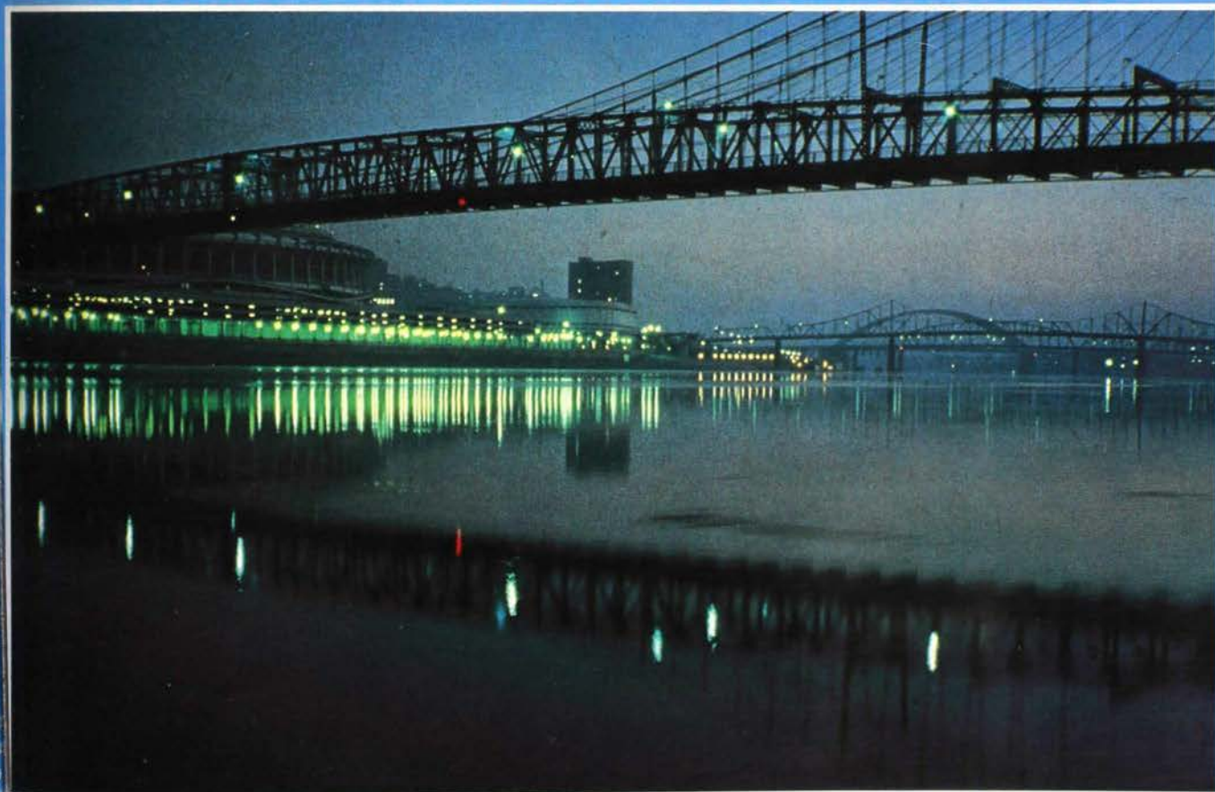
The Cincinnati Riverfront