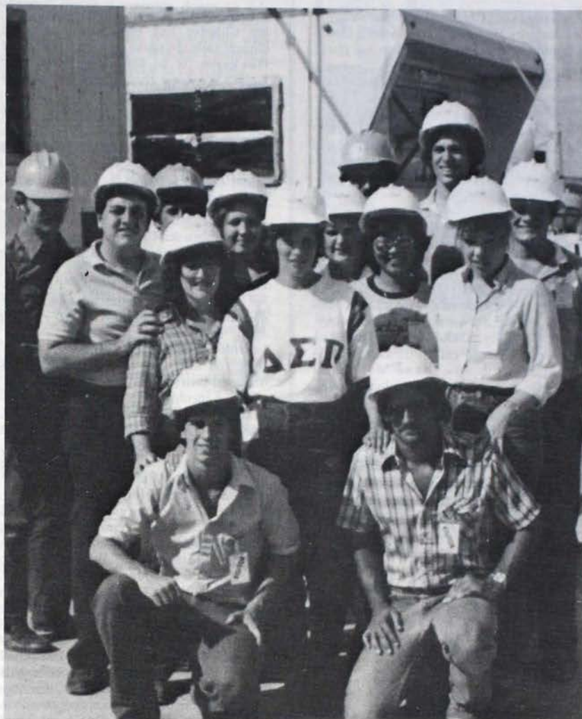
These members of the Eta Iota Chapter at Nicholls State recently toured the Waterford-3 Nuclear Plant.

Our third annual Information Systems Day was a wonderful learning experience as well as an enjoyable social event. It was held on the Northeast Louisiana University campus in the Student Union Building. The Eta Omicron Chapter has sponsored the Information Systems Day for the past two years and we have had many businesses attend to display their computer systems; this year we had more vendors than ever be-