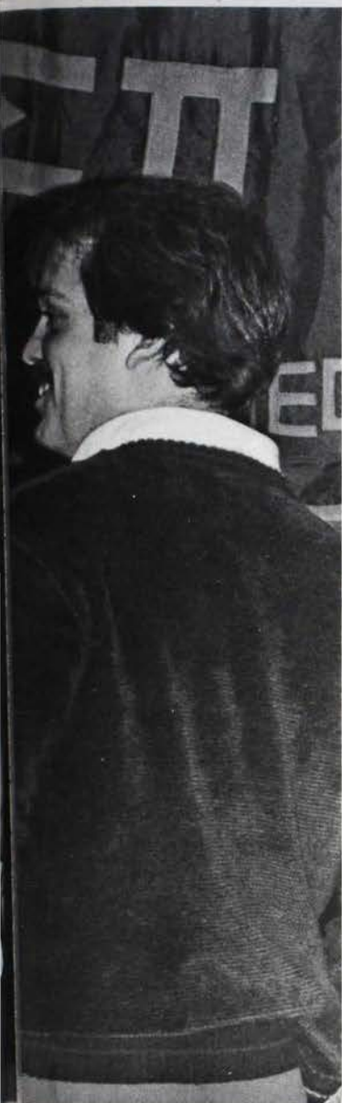
Chapter at Northern Arizona, greets a