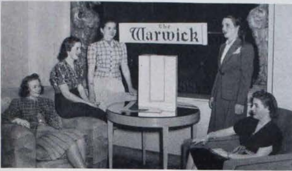
TEMPLE AND PENNSYLVANIA COEDS PATIENTLY AWAITING THE ARRIVAL OF GRAND CHAPTER CONGRESS VISITORS

It seems unnecessary to urge anyone to attend a Grand Chapter Congress. If you have never attended the anticipation of a new experience is sufficient to bring you. And if you have ever been to a Grand Chapter Congress the desire to meet old friends and to meet new ones and to participate again in the progress of the fraternity is reason enough for your return. At this convention Delta Sigma Pi will offer you four days of inspirational living, an opportunity to make new friends and to renew old ones, and a wonderful time. Can you afford to miss it?