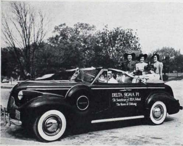
THE ENTRY OF OUR TEXAS CHAPTER IN THE UNIVERSITY OF TEXAS ROUND-UP PARADE