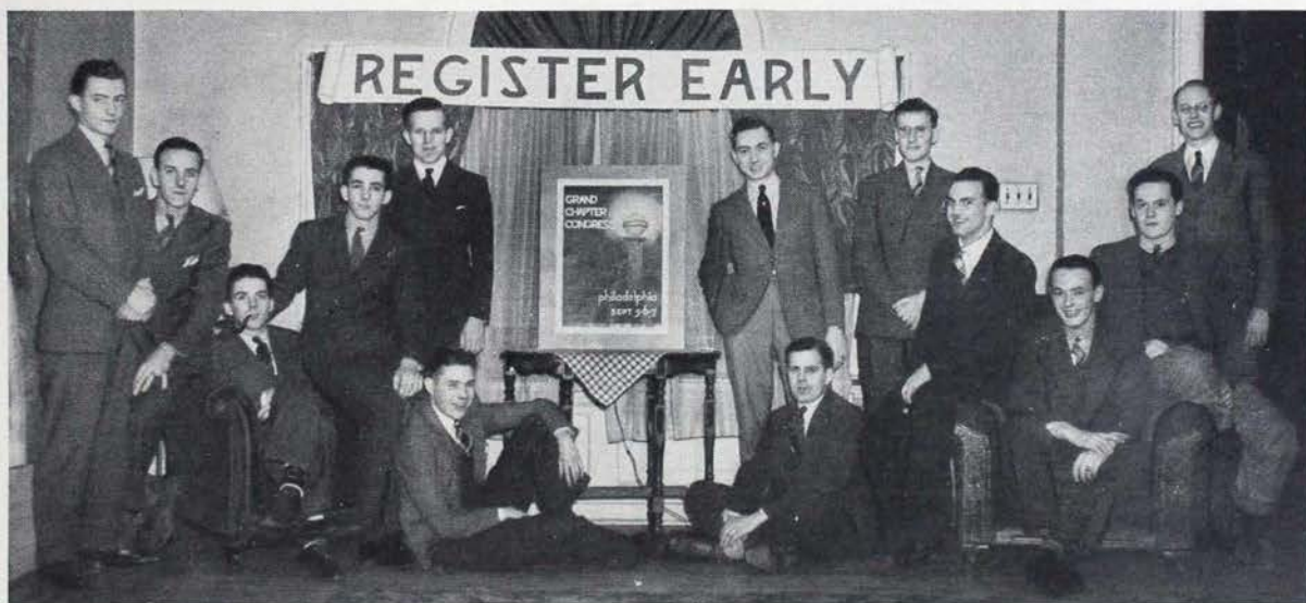
THIRTEENTH GRAND CHAPTER CONGRESS COMMITTEE

All of these events have been priced reasonably and are well within the means of all. The registration fee will be $2. It has been the custom of Delta Sigma Pi to prepare a budget of the many convention activities aside from lodging and meals and to divide the cost equally among all those participating in the form of a registration fee which provides an adequate working fund to defray the overhead of the meeting and the cost of the entertainment activities. The committee has prepared a most conservative budget based upon an estimated number of registrations. We do not want to have a deficit and your registration in advance will greatly assist the committee in adequately planning for your comfort and entertainment in Philadelphia next September. Over 100 members from all over the country have already paid this $2 registration fee and received their registration cards. We would like to have some idea as to the number of out-of-town members who will be present and we fraternally urge you to forward your remittance for $2 and secure your registration card now from the Central Office of the fraternity in Chicago or from the General Committee in Philadelphia. A number of plans for your enjoyment must be held in abeyance until we know the approximate number who will be present from out-of-town.