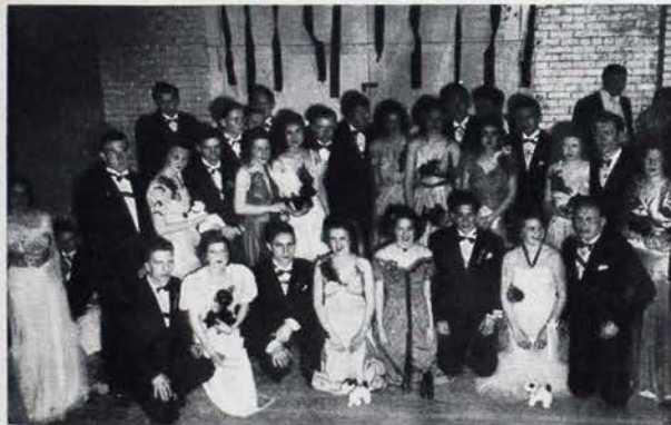
MEMBERS OF ALPHA SIGMA CHAPTER AT ALABAMA AND THEIR PARTNERS PRESENT AT THE COMMERCE BALL HELD THERE