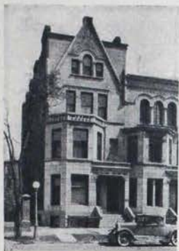
42 CEDAR STREET Chicago

ON FEBRUARY 7, 1914, thirteen students in the Northwestern University School of Commerce in Chicago were initiated as the charter members of Beta Chapter of Delta Sigma Pi. This group had been organized in 1911 as a local commerce fraternity at Northwestern. On February 11, 1939, twenty-five years later almost to the exact day 157 members of Beta Chapter gathered around the banquet table to celebrate the Silver Anniversary of the second chapter of Delta Sigma Pi.