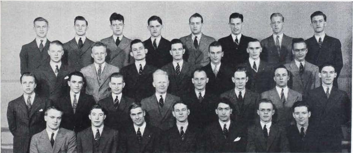
ALPHA EPSILON CHAPTER—UNIVERSITY OF MINNESOTA