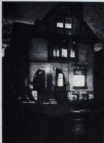
A NIGHT VIEW OF OUR MARQUETTE CHAPTER HOUSE

Social activities are still going strong. On March 4, we