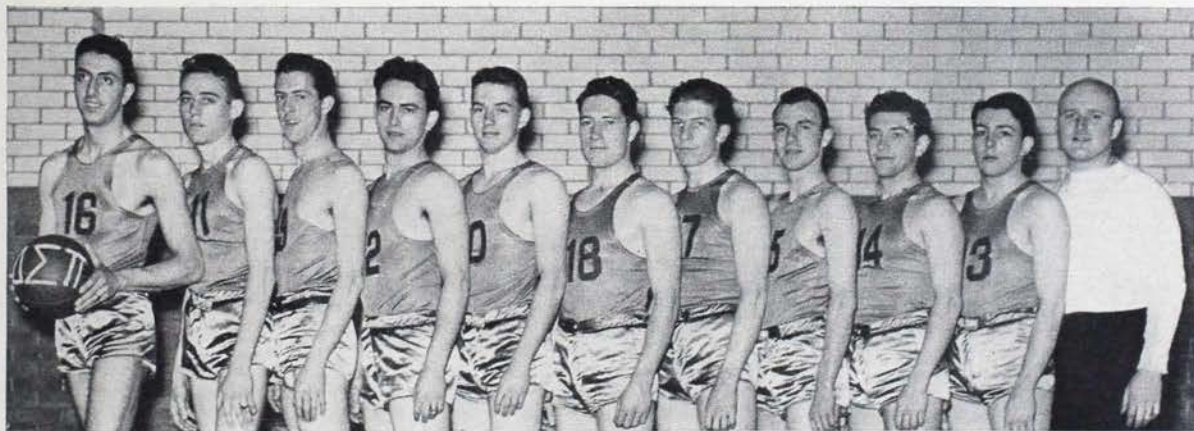
THE BASKETBALL TEAM OF OUR CREIGHTON UNIVERSITY CHAPTER