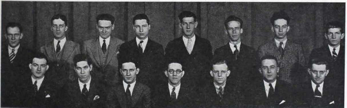
ALPHA THETA CHAPTER—UNIVERSITY OF CINCINNATI