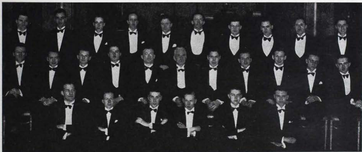
BETA MU CHAPTER—DALHOUSIE UNIVERSITY