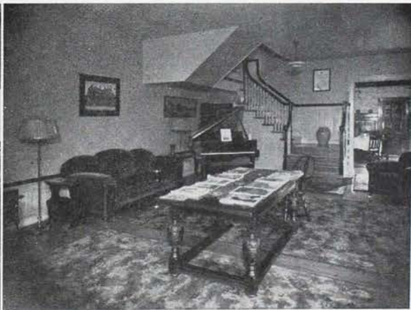
REMODELED PARLORS OF OUR PENNSYLVANIA CHAPTER HOUSE