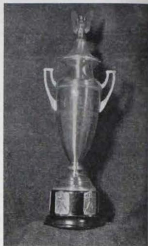
ALL-MCKINLOCK SWEEPSTAKES TROPHY

In track, swimming, and ice skating each fraternity receives five points for each team entering and competing in the meet, finishing in at least one event. Five points are bestowed for a first place in each race, three for second, and one for third. Each team, however, may add to its sweepstakes total one-half of the total number of points scored in the meet. The same plan holds true in the swimming relays races and fancy diving, except here eight points are won for a first, six for a second, four for a third, and two for a fourth. In ping pong, tennis, and horse shoes, points toward the trophy are procurable as follows: one point per man up to and including a maximum of ten men. This makes